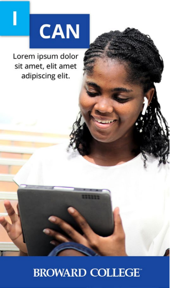
FRAME 03-05: "I CAN" stays while three different supers run