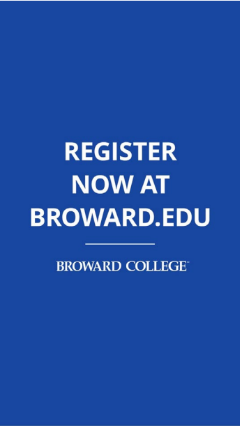
FRAME 07: CTA appears with logo